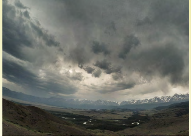
View of the Golden Mountain Range

In the Altai region, a main river is the Katun; that river has "white" colored water. The river originates from the top of Belukha. According to an Altai legend, the river in Shambhala has "white" colored water, too. We were in the right place. When we arrived at the place, we saw