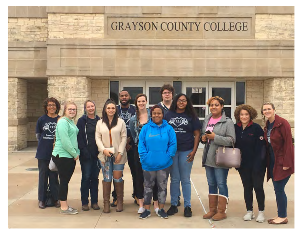
Student Support Services students at Grayson's South Campus