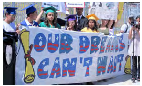
Undocumented students and supporters at a recent rally at the Roybal Learning Center in Los Angeles.

Since the beginning of the presidential election the Sanctuary Movement has inspired four states, thirtynine cities, and three hundred sixty-four counties to adopt pro-immigrant policies. The cities from these states such as San Francisco and many more have promised to protect all immigrants. Even the police officers in these cities have been contributing to this movement; they will not be