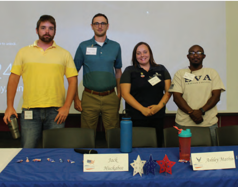
Grayson staff from the Center of Excellence for Veteran Student Success at the 2018 Veteran Services Providers Symposium in Gainesville

related questions and provided much information and in-depth thought about relevant and topical issues that benefitted all attendees. The value of this type of educa-