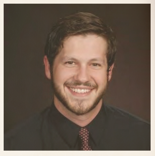
New Baptist Student Ministry Director encourages students of every faith to come check out the resources of the BSM