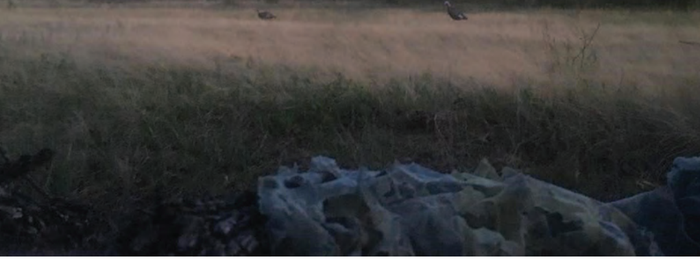
tors while eat- A decoy spread of a male turkey following a female turkey during the 2018 spring ing on acorns turkey season about 25 yards away from the seat in the tree line on a unit of the LBJ and other herbs Grasslands

Jackson also talks about how the flock size and amount of nutrition play a role in a turkey's life. "Turkeys are in smaller, more spread-out flocks in the spring because there is more nutrition around for the turkey to consume since all grass-