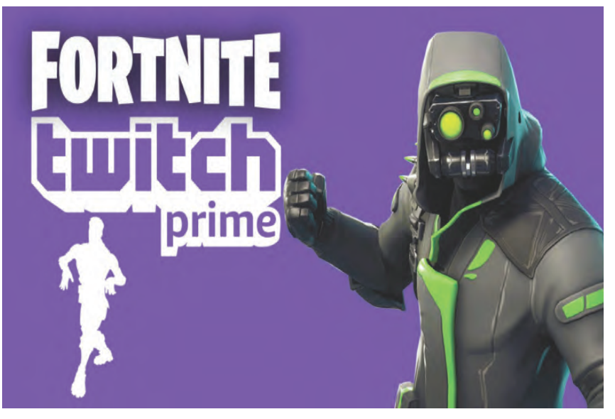
The Twitch Fornite streaming screen

During this time, friends not only enjoy the competitive game with each other, but they also take this time to just catch up with their friends.