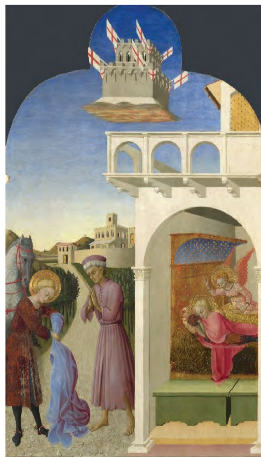
ailsaspx?q=NG4757&ng=NG4757&frm=1) On the right, an angel visits St. Francis in a dream, at the top center, St. Francis sees a vision of the Heavenly kingdom, and on the left, St. Francis give a poor knight his cloak--three distinct moments in time happening simultaneously in the image.

For more information about this exhibit, the 2nd Floor Gallery and other Grayson College Art Events, please visit our Facebook page: Grayson College Visual Arts Department .