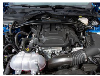
The Mustang's Eco-Boost engine made in 2020