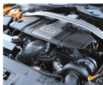
The Mustang's V8 engine, the Coyote, made in 2020

The Eco Boost accelerates to 60 in just under 6 seconds.