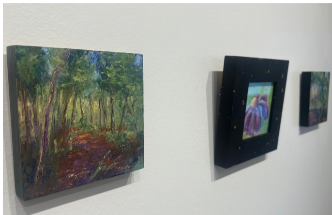
Work by Cindi Menton and Meagan Pond

of art. The show features a wide variety of work from still life and landscapes to abstract and surreal subjects, there is even a clown.