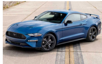
The 2020 Mustang GT

While that is not that impressive, it is still nothing to balk at, while it also completes the standing quarter-mile in high 14 to 15 seconds, putting it at around 3 seconds slower than the V8.