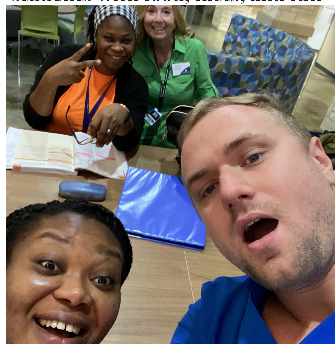
Licensed Vocational Nursing students ham it up with South Campus Dean