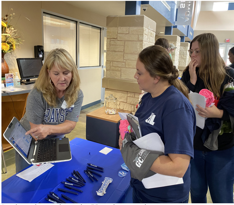
Students learn about the Upswing tutoring program during the South Campus Cookout