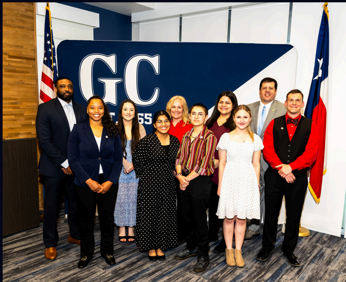
2024-2025 Presidential Ambassadors

the requirements for the program are selected through a screening process by an advisory committee. Members are required to commit one full academic year and 10 hours of service each week. Presidential Student Ambassadors 2024-2025 activities and service events include: recruiting and outreach events, commencement ceremonies, fundraising events, and leadership training.