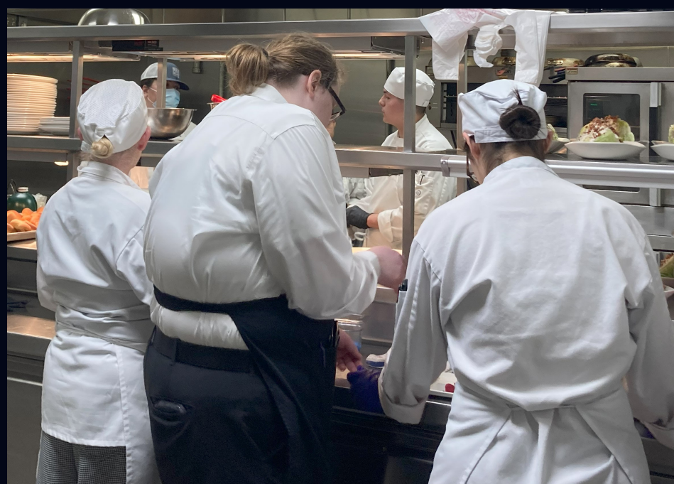
Culinary students from various classes help each other in prepparing dishes for a full dinning room.