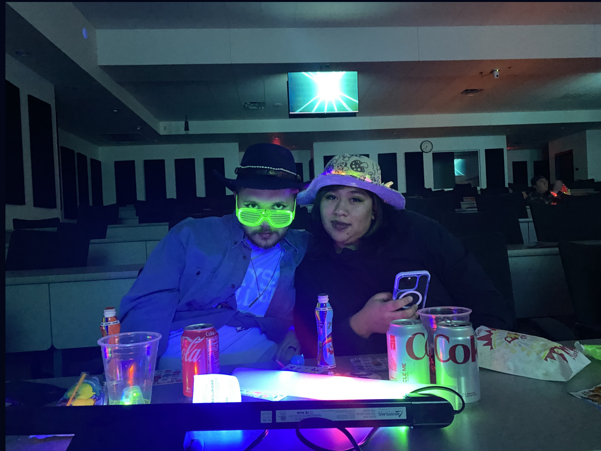
Two students accompanying each other at bingo night.